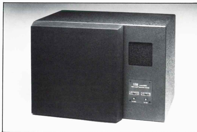
Model 809 shown with optional grille.